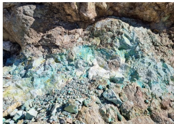
Plate 2: Firetail Board site visit to Picha Copper Project in Peru