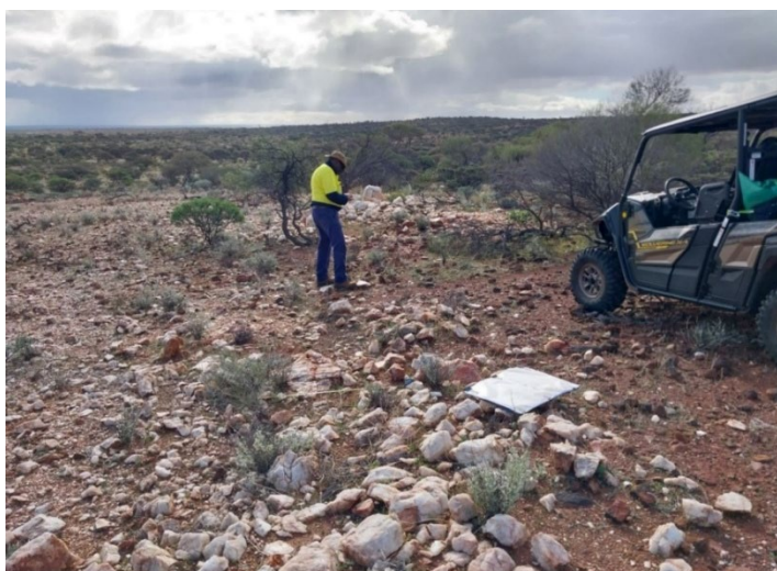
FIGURE 1. Mapping at the Yalgoo Lithium Project, May 2022

A Permit of Work (PoW) application for the proposed auger and drilling programs was submitted to DMIRS, with approval received in late June 4 .