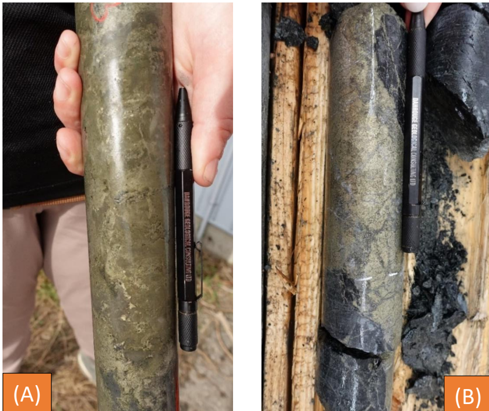
Figure 1: Significant intersections in drill hole YH24-123

The drill intercepts remain open updip and downdip, with assays pending for drilling completed up and downdip of drill hole YH24-123 and drilling continuing along strike. These results further highlight the potential the Firetail team sees, as drilling continues to increase scale and confidence at the Skyline Copper Project.