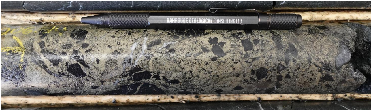
Figure 3: Drill hole YH24-123 -206.24 - 206.95m, 11.22% Cu, 0.44% Zn & 13.4g/t Ag

In addition, a high resolution airborne EM survey has been planned across the initial Project area which comprises of 16km of prospective geological strike. Blind EM targets defined from this program will be ranked and if warranted drill tested.