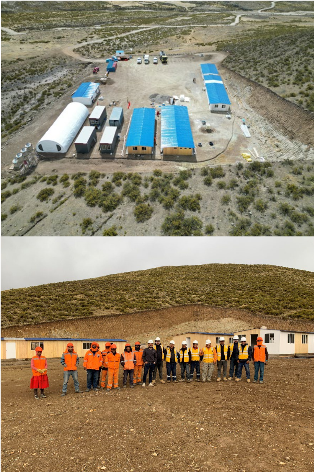
Figure 3: Picha exploration team and camp site