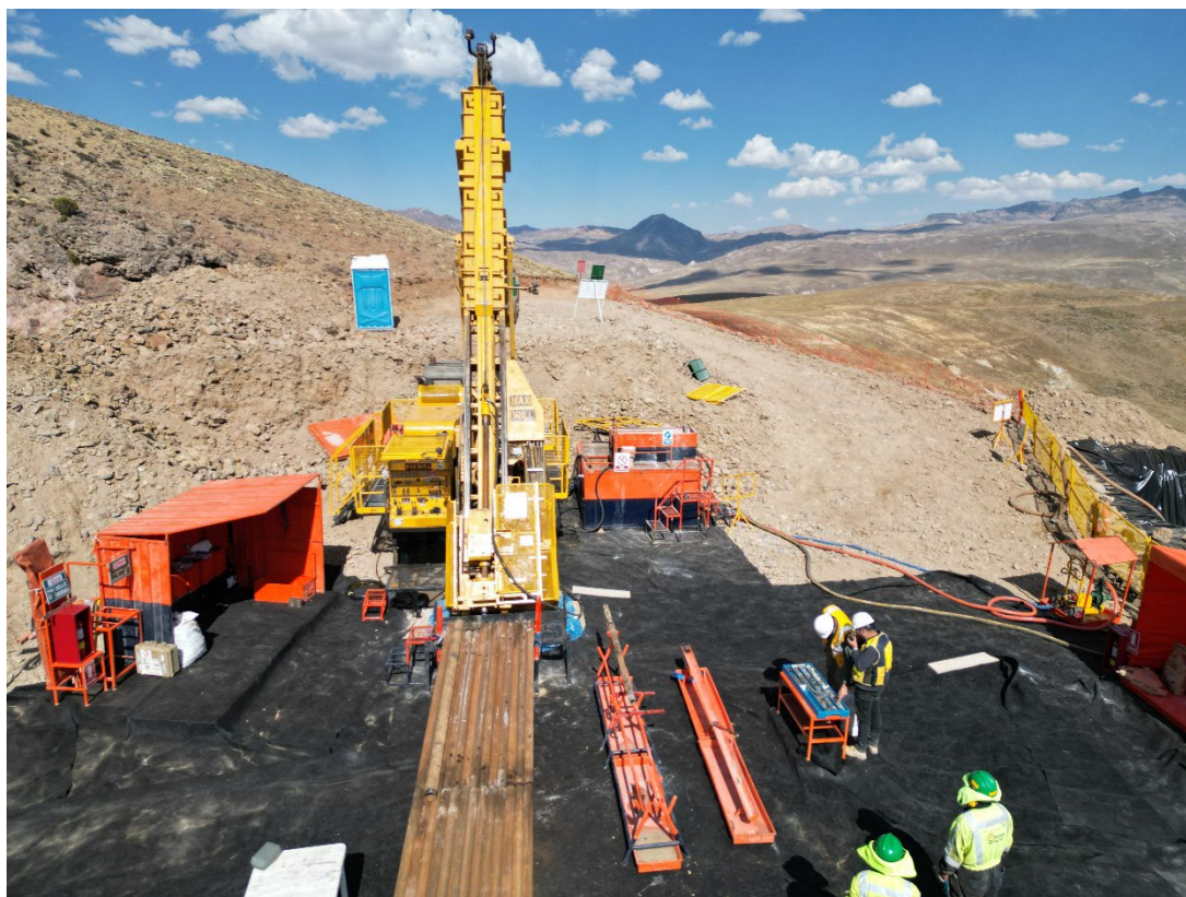
Figure 1: Drill rig on site at Cobremani target

"The team has generated a significant number of targets through the exploration work completed so far, and we look forward to bringing regular drilling updates to our shareholders and followers in the coming weeks."