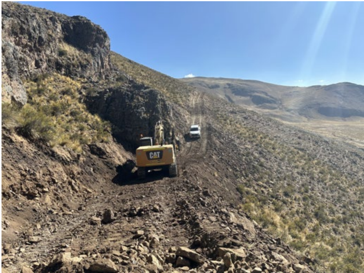
Figure 4: Access road construction underway at Picha Project in Peru

Access roads and drilling pads for the first 9 holes are well progressed and due for completion by the end of September to facilitate the commencement of drilling in the first week of October 2023.