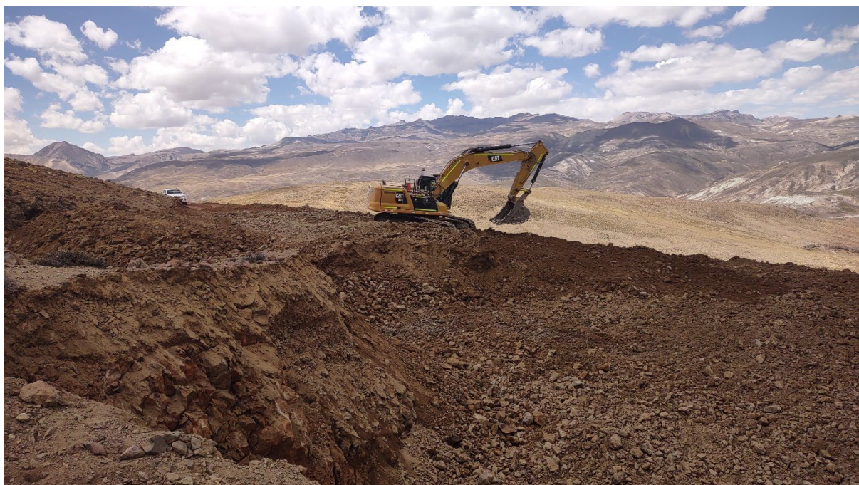
Figure 5: Drill pad construction underway at Picha Project in Peru