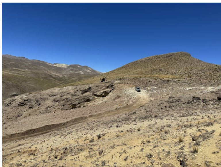
Figure 1: Drill site preparation at Cumbre Coya target

"We look forward to the commencement of drilling in the next two weeks."