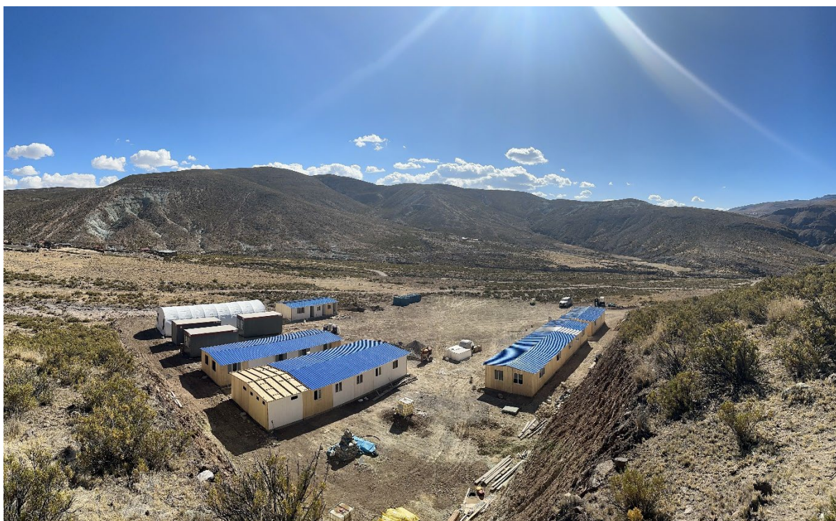
Figure 3: Exploration camp under construction at Picha

Camp installation has progressed according to plan and completion works are now underway on the final fittings.